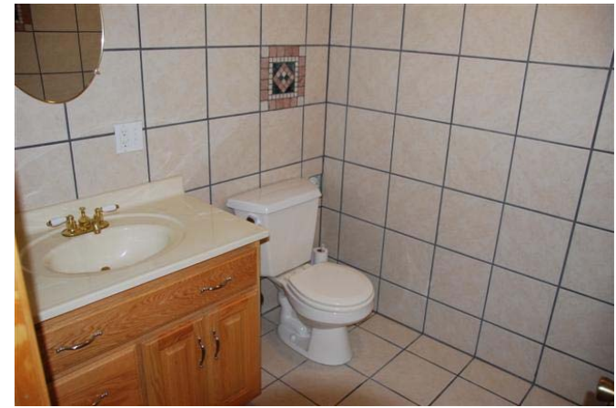
Main Floor Bath